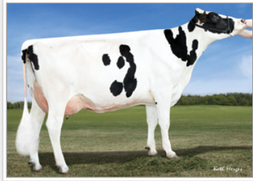
Sheekno11 Abram Benita