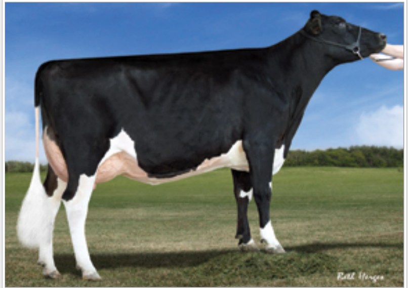
Sheekno11 Abram Bridie