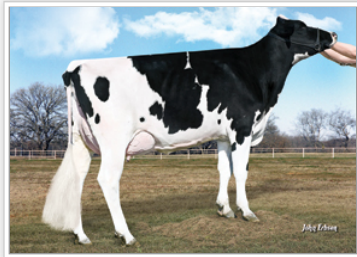
Goff Abram 34553